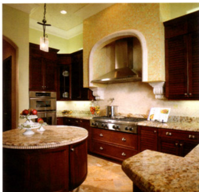
▲ The kitchen is both elegant and functional. Alfa Cabinets built and installed the luxurious cabinets that have the look of fine furniture.