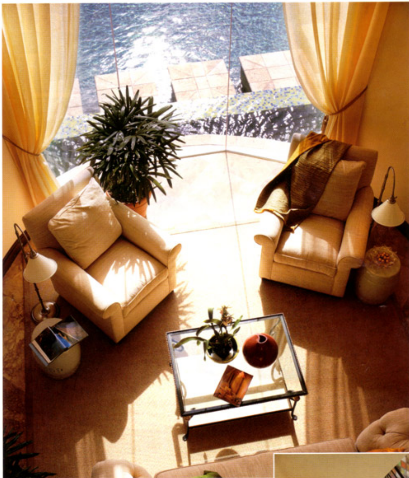
◀ Mazas Design Gallery in Dunedin decorated the home to take advantage of the large windows and the beautiful views beyond.